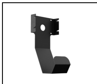
LENERGIZEE cable hanger RAL9005 (424281)