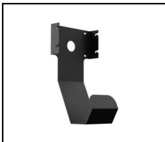
LENERGIZEE cable hanger RAL9005 (424281)