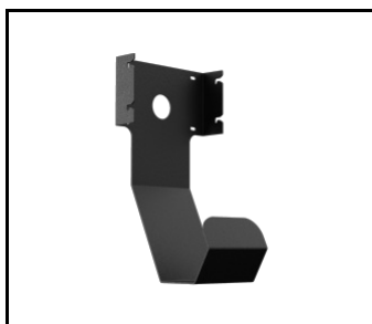
LENERGIZEE cable hanger RAL9005 (424281)