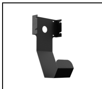
LENERGIZEE cable hanger RAL9005 (424281)