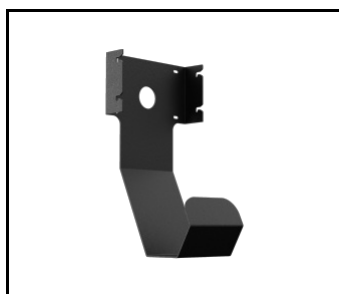
LENERGIZEE cable hanger RAL9005 (424281)