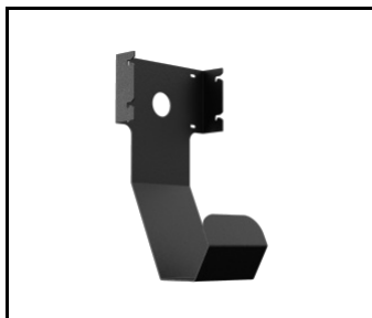
LENERGIZEE cable hanger RAL9005 (424281)